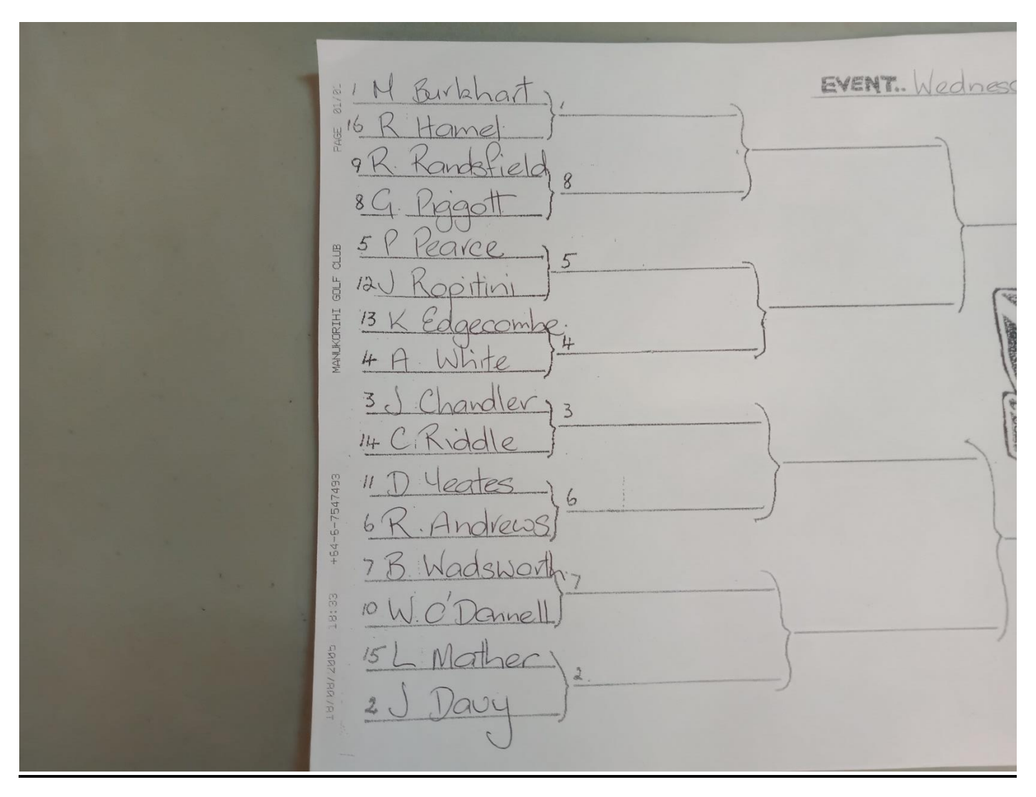
Top 16 playing for Wednesday Trophy